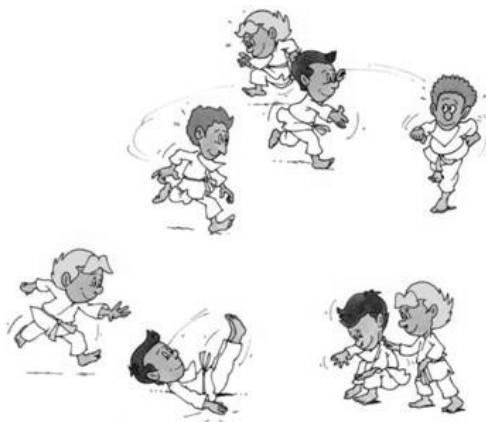
"run away or fall"

Game path: a child, drawn by lots, holds the pursuer role, while the playmates freely move around the gymnasium with a colored thin cardboard kept by the chin on the chest. At the teacher's starting signal, the pursuer will try to catch the playmates who can save themselves only by executing a backwards fall without losing their thin colored cardboards (safety position). If the pursuer succeeds in catching a child before he had assumed the safety position, the latter will take the place of the pursuer. In any case, the teacher will look after the alternate of the pursuer role among the children.